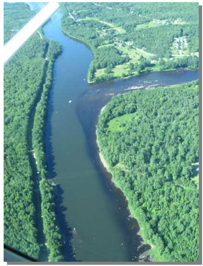
Confluence of Mattawamkeag River (right) with the mainstem of the Penobscot River.

Specifically, the World Health Organization (WHO), suggests that if there are 10 µg/L or more of cholorophyll a, with a dominance of and 84% of the total cell numbers. Other cyanobacteria, there should be risk advisories posted on site. The August 17 chlorophyll a reading put the risk at the next naegeliana , Microcystis sp., Anabaena sp. level of concern on the WHO standards at which they suggest restricting bathing and further investigating the hazard. We felt that toxin producer, but is morphologically this affirmed/legitimized our desire to be proactive and post advisories.