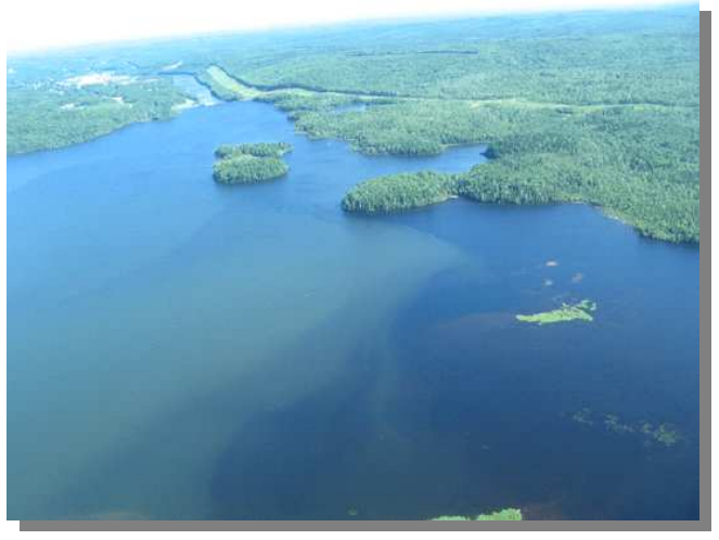
Dolby Pond looking downriver - West Branch flows in from right.

The bloom was first noticed on July 31st during a cooperative intensive sampling effort with the Maine Department of Environmental Protection (DEP) to collect information for the revision of the Penobscot River model. However, when looking back